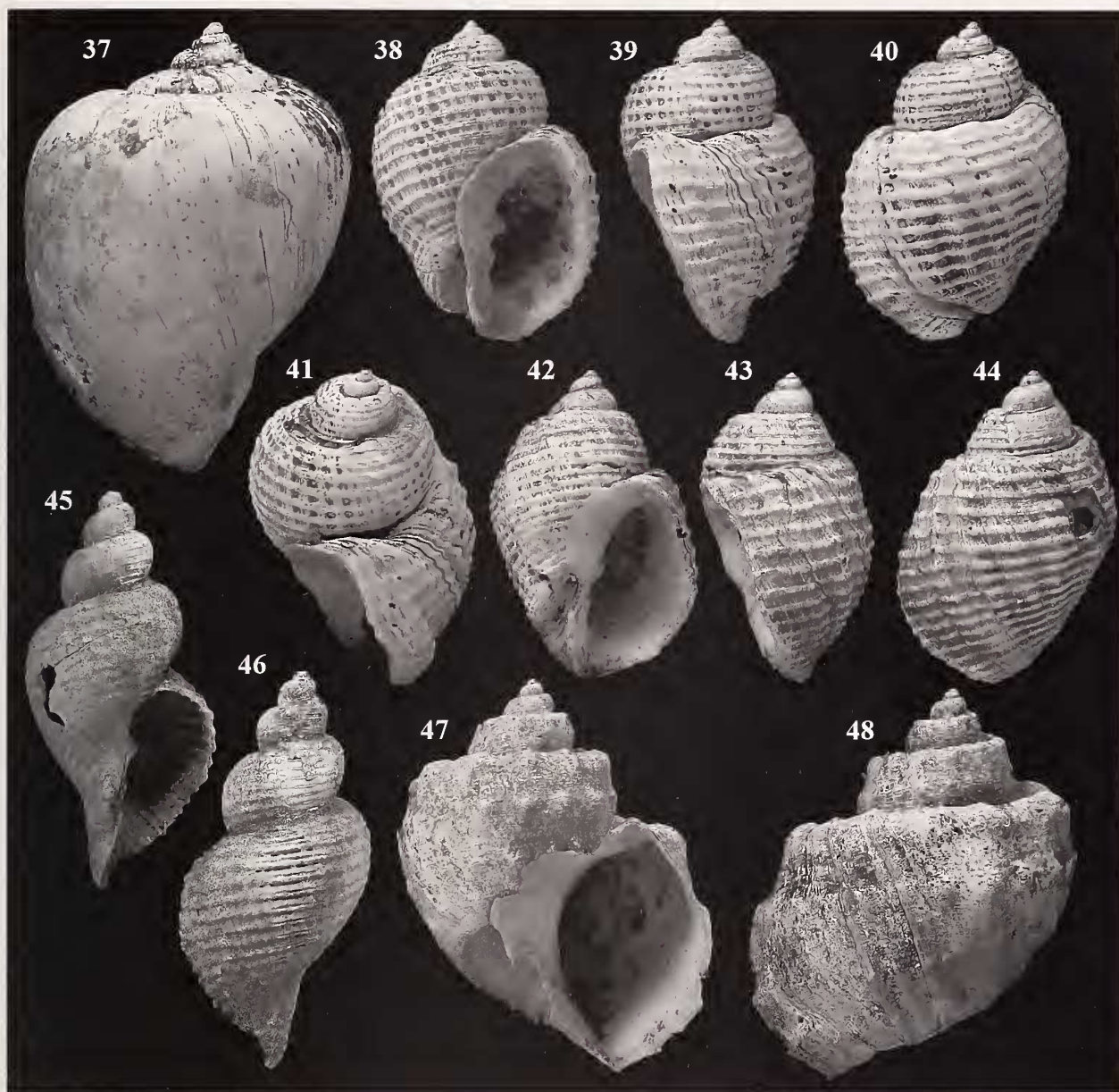
Figures 38–48. Figures 38–41. Cancellaria (Massyla) cubaguaensis nov. sp. Holotype; MOBR-M-3363 (EDIMAR coll.), Locality 1, Cañon de las Calderas. Height 25.9 mm. Figures 42–44. Cancellaria (Massyla) cubaguaensis nov. sp. Paratype, BL coll., Locality 1, Cañon de las Calderas. Height 22.4 mm. Figures 45–46. Cancellaria (Charcolleria) terryi Olsson, 1942. BL coll., Locality 1, Cañon de las Calderas. Height 46.0 mm. Figures 47–48. Trigonostoma (Ventrilia) rucksoruni (Petuch, 1994). BL coll., Locality 1, Cañon de las Calderas. Height 35.9 mm.

and the siphonal canal much longer. Cancellaria (Massyla) jadisi Olsson, 1964 from the Upper Miocene Angostura Formation of northwestern Ecuador is also closely similar, with a low spire and a very short siphonal canal, however it differs mainly in the shape of the last whorl, which is more rounded, the periphery at rather than above mid-whorl and more constricted